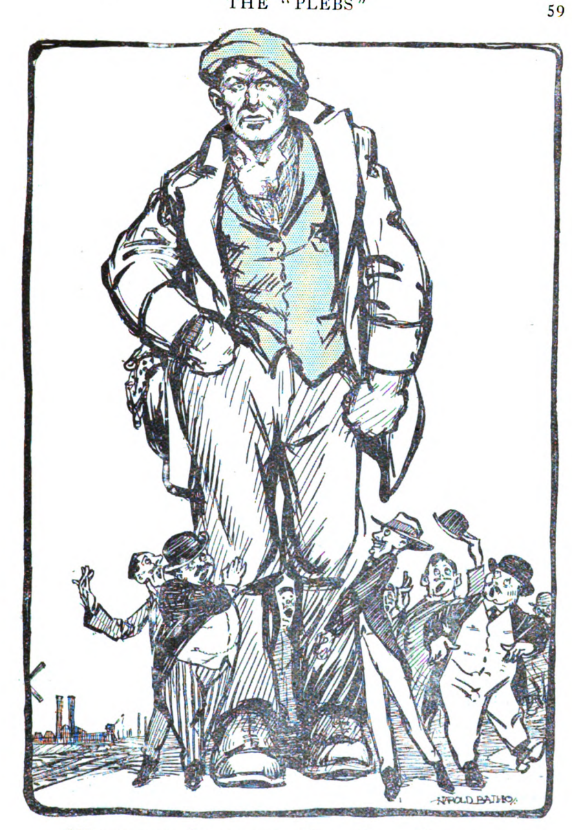
WHEN THE RANK AND FILE GETS RESTIVE The Official (in chorus) :--- "You made me love you ------I didn't want to do it ! &c., &c.